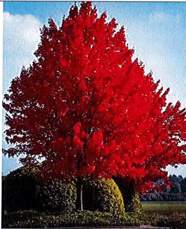
Red Maple Tree (Autumn)