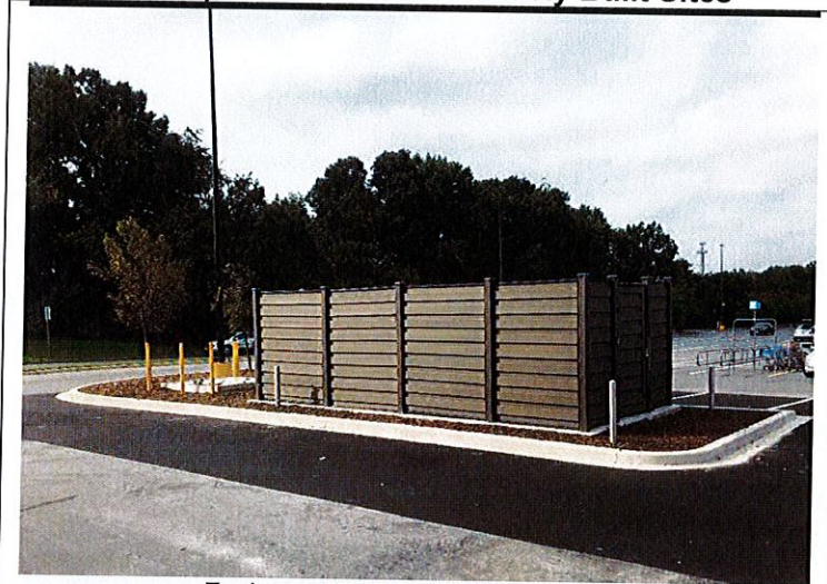
Equipment Enclosure – TREX Fence