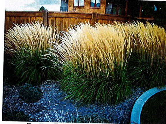
Feather Reed Grass 'Karl Foerster'