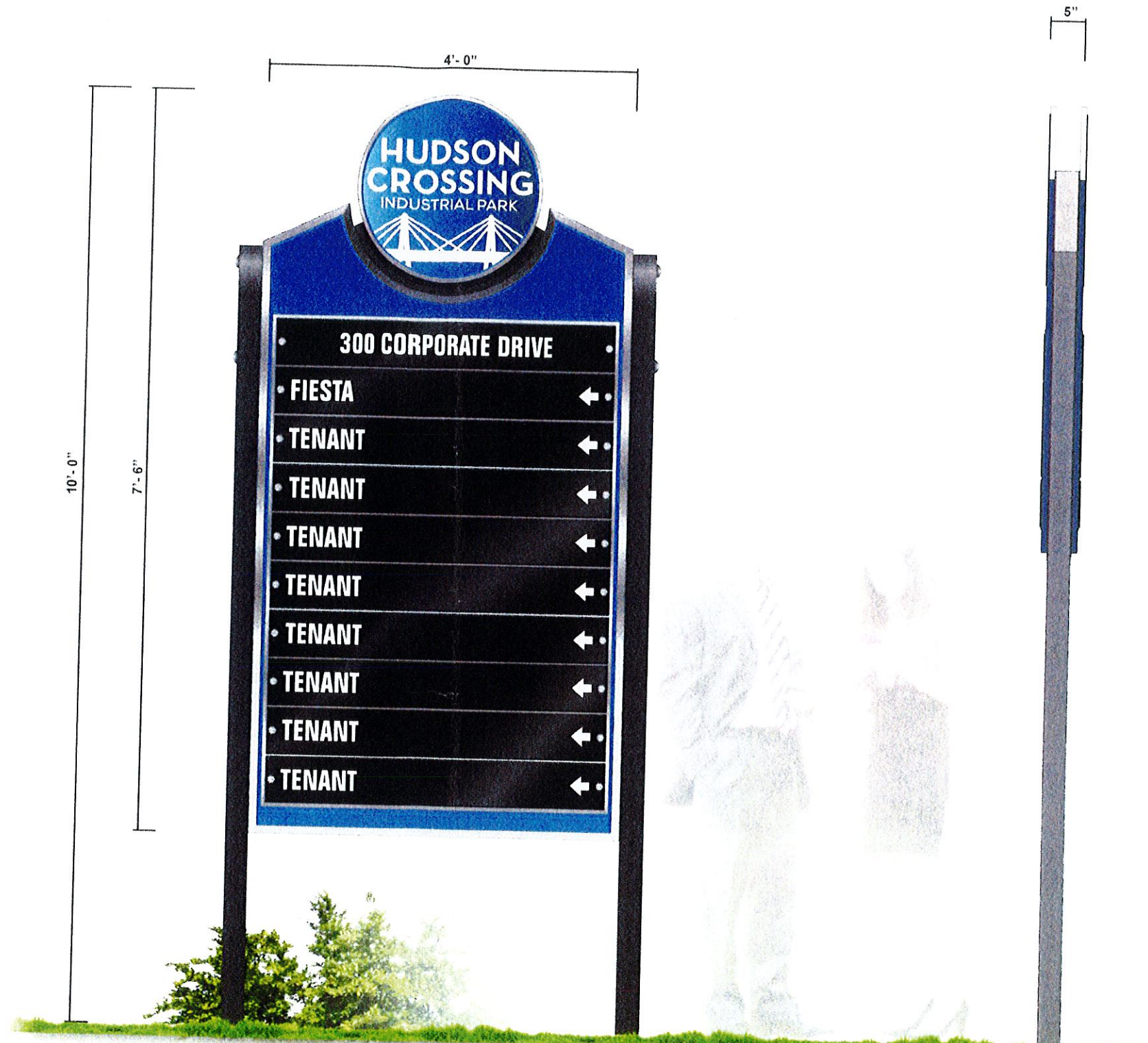
FRONT VIEW SCALE: 3/4"=1'