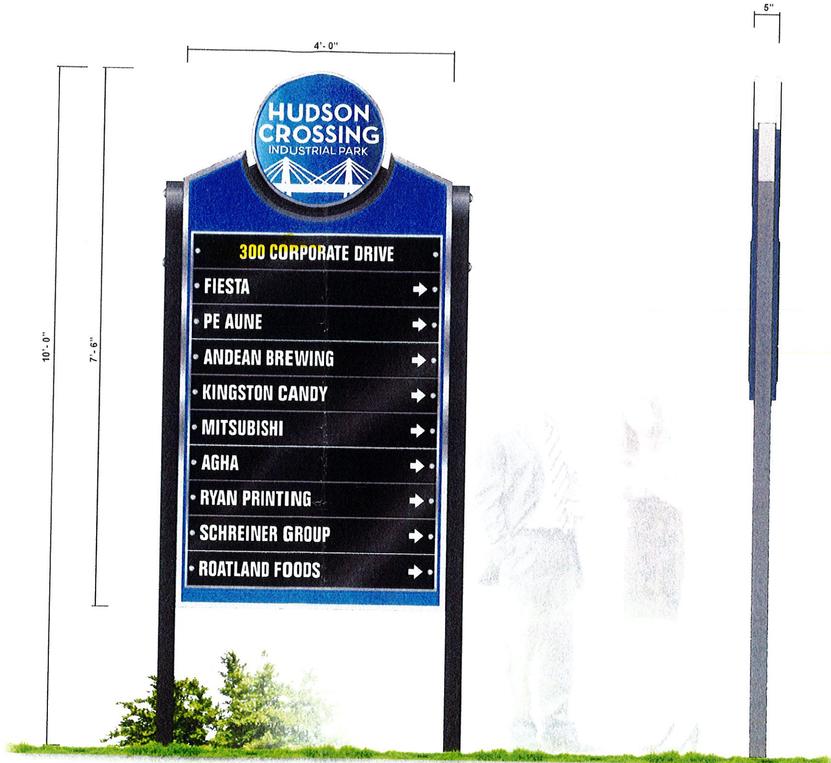
FRONT VIEW SCALE: 3/4"=1'