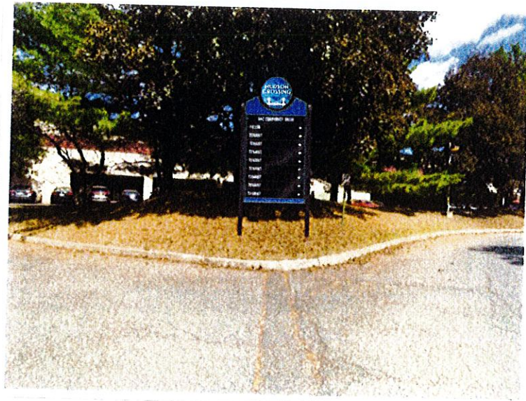
SIGN LOCATION SCALE: NTS

FIELD SURVEY REQUIRED SQUARE FOOTAGE: 30 SQ. FT