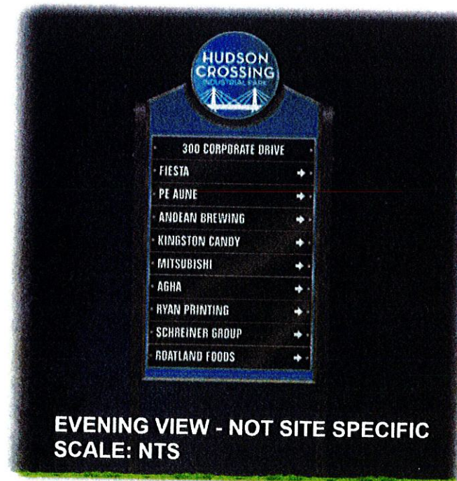
EVENING VIEW - NOT SITE SPECIFIC SCALE: NTS