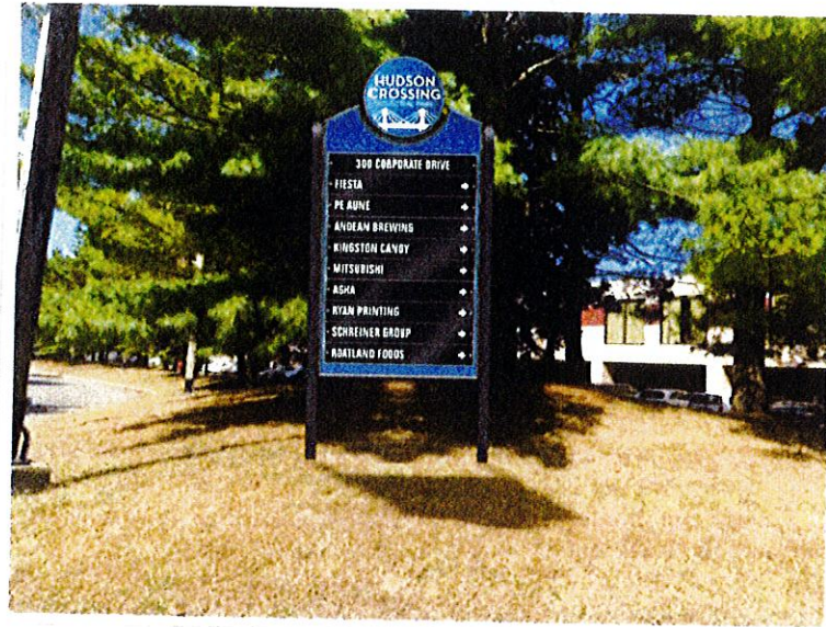
SIGN LOCATION SCALE: NTS

FIELD SURVEY REQUIRED SQUARE FOOTAGE: 30 SQ. FT