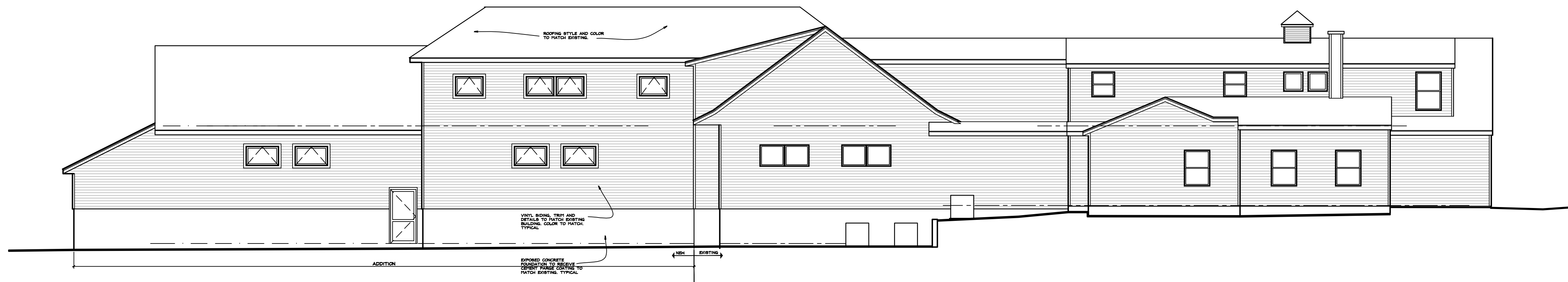
C BACK (NORTH) ELEVATION A7 1/8" = 1 FOOT

South Orangetown Ambulance Corp. 70 Independence Avenue Tappan, N.Y. 10983