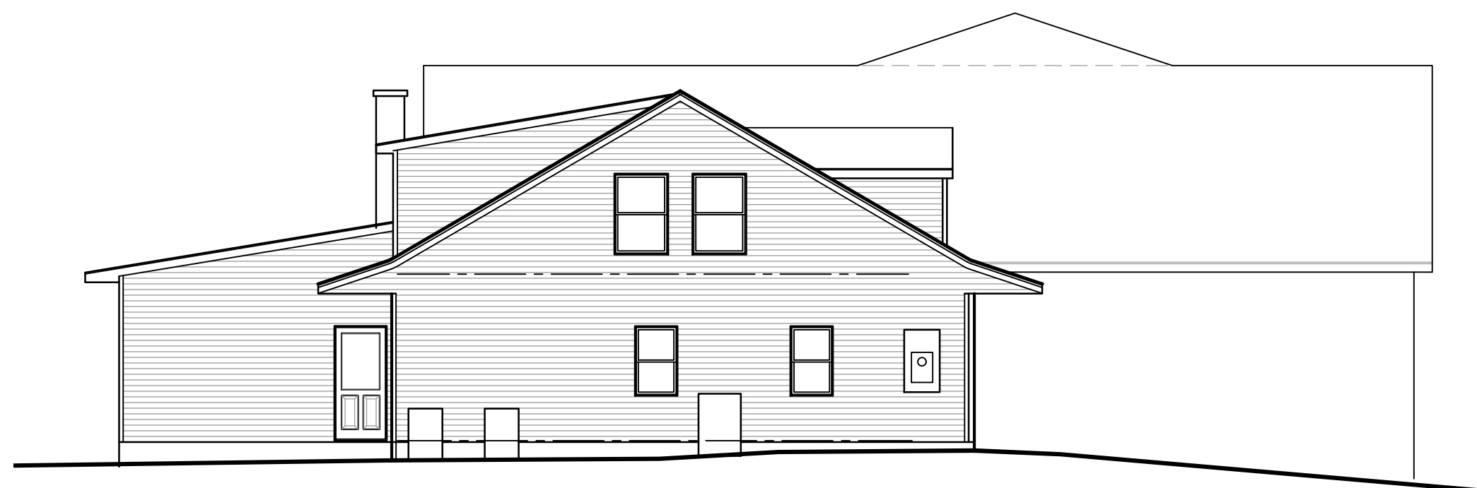
B WEST ELEVATION A7 1/8" = 1 FOOT