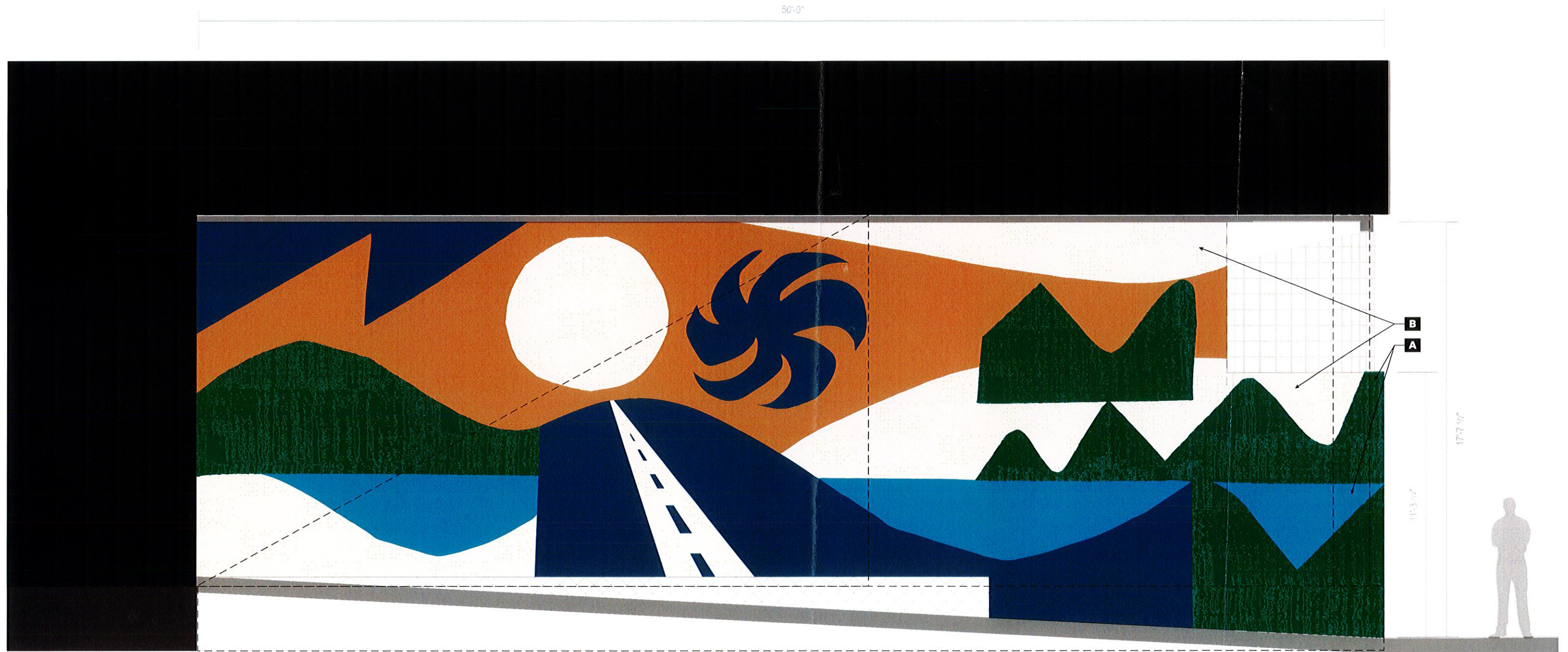
Exterior Delivery Mural - Wall Elevation Scale: 1/4" = 1' - 0"