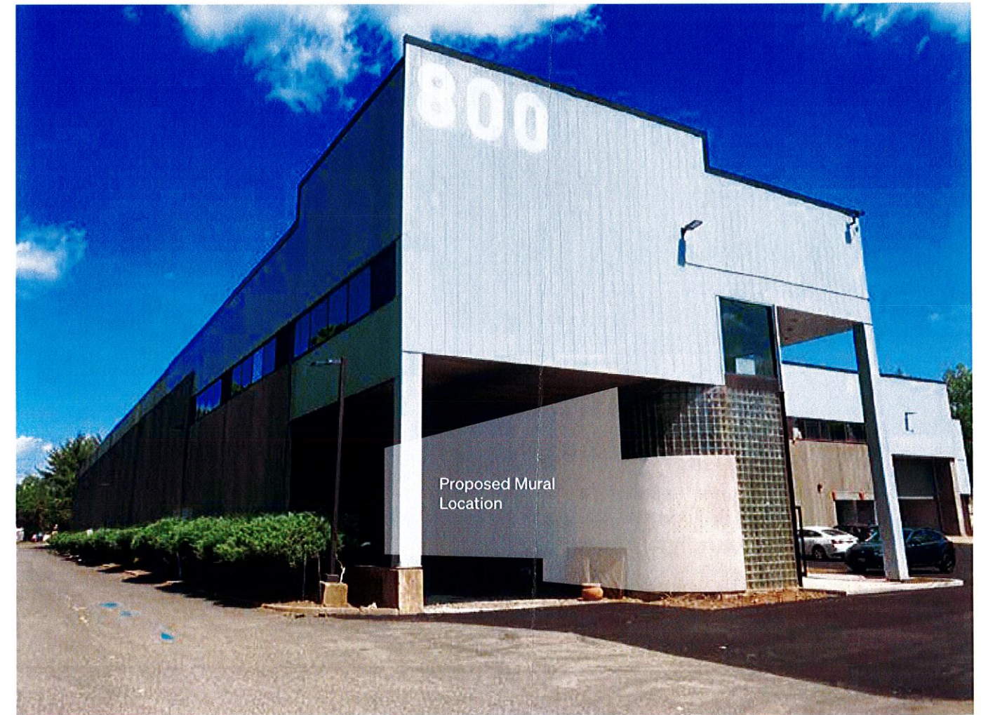
Photo of existing conditions