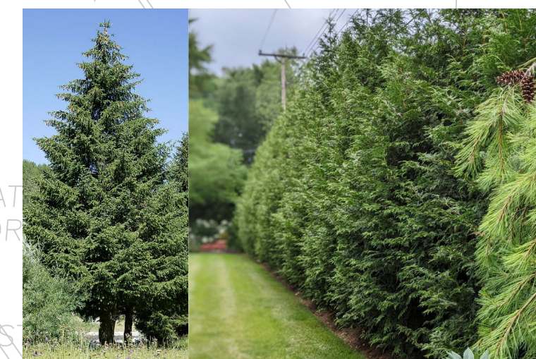
Picea abies Thuja plicata 'Green Giant'