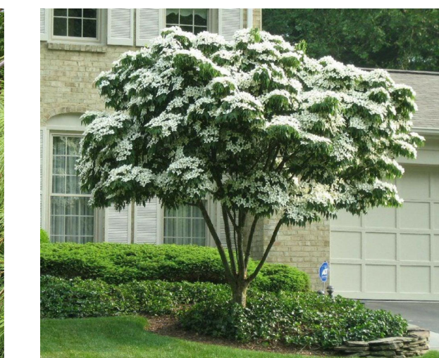
Cornus kousa 'Milky Way'