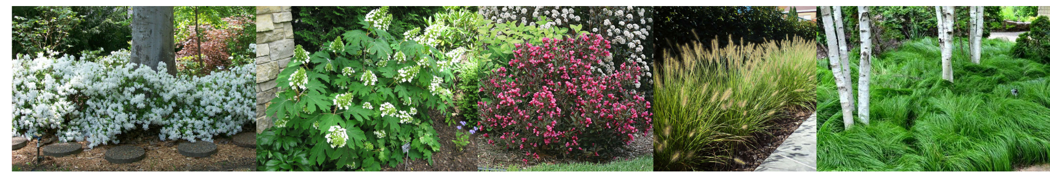
Rhodo 'Delaware Valley White' Hydrangea quercifolia Weigela florida 'Wine and Roses' Pennisetum alopecuroides 'Hameln' Carex pensylvanica