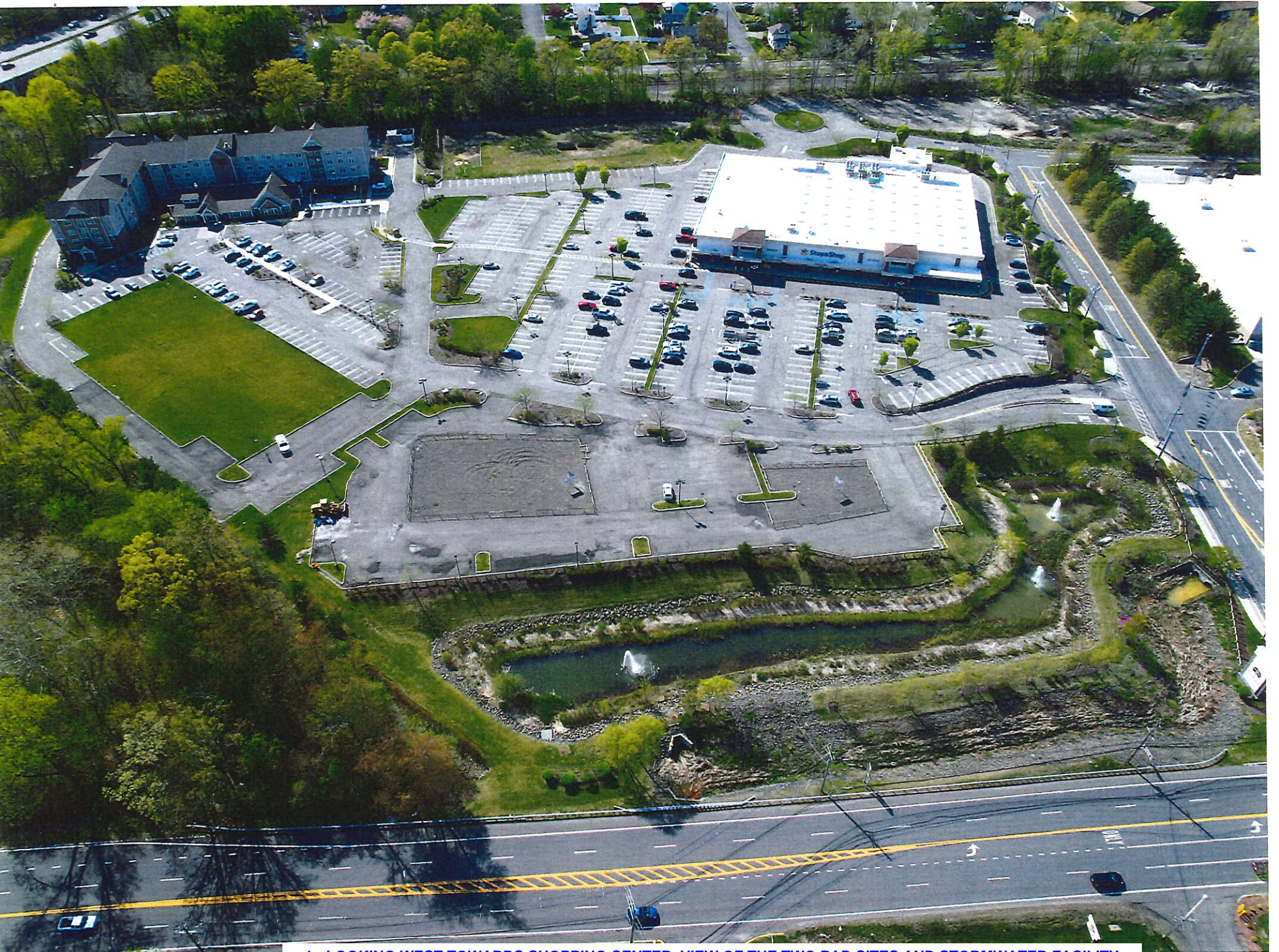
1 - LOOKING WEST TOWARDS SHOPPING CENTER. VIEW OF THE TWO PAD SITES AND STORMWATER FACILITY