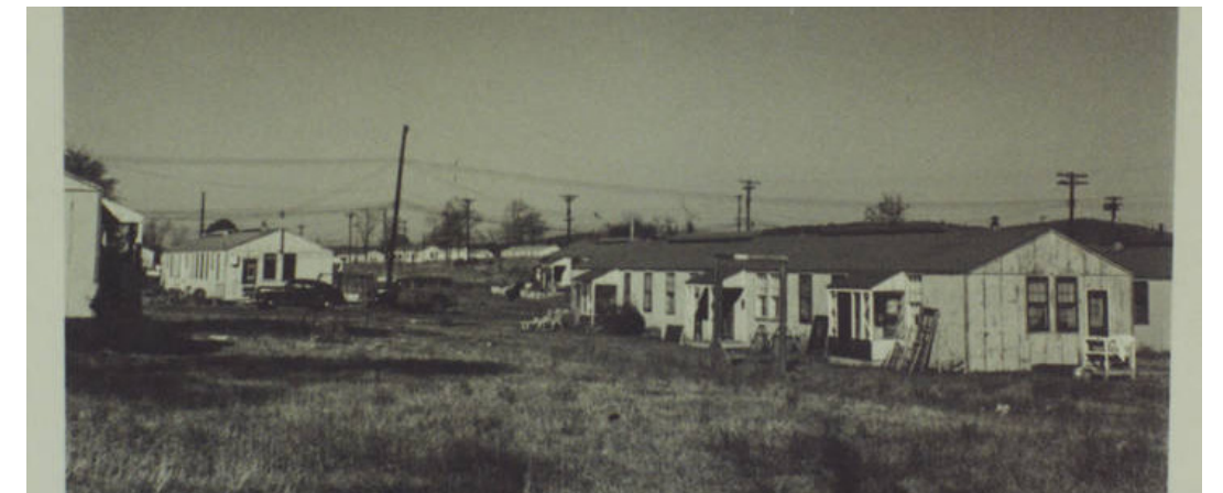
Camp Shanks, Orangeburg, circa 1945.