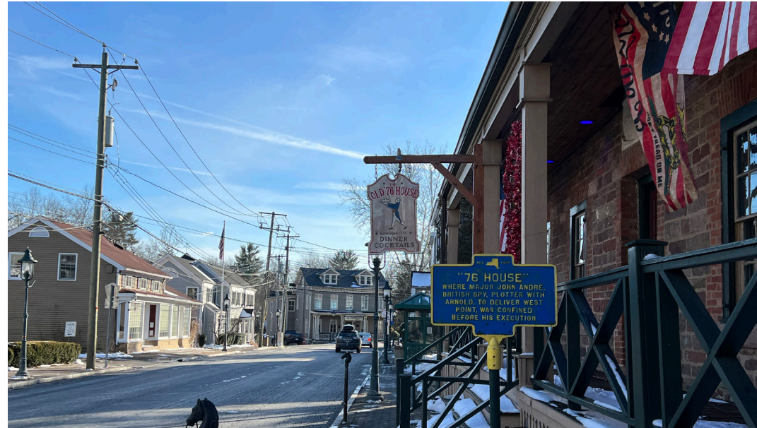
110 Main Street, Tappan ("76 House")

The 18th century sandstone house at 110 Main Street (S/NR-Listed) is significant as the location where convicted British Spy Major Andre was confined prior to his hanging on a nearby hill. The property is located within the Tappan Historic Area and within National Register Tappan Historic District.