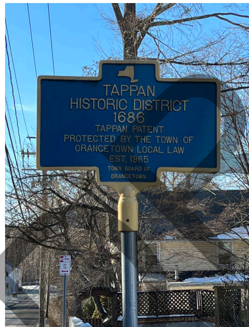
Tappan Historic District

The hamlet of Tappan is located in the southern portion of Orangetown. The hamlet’s boundaries are indefinite, though the Tappan Historical Area map adopted by the Orangetown Town Board in 1965 includes the area that covers 30 properties within the commercial and residential core, roughly bounded by the Sparkill River on the east, the south side of Main Street, Brandt Avenue to the west, and Greenbush Road Cemetery to the north. The period of significance for the district is 1730 to 1920, including sandstone structures from the 18th century, Greek Revival style buildings constructed in the early 19th century, Gothic Revival-style residences, and a Colonial Revival style store and a stables, both built in the early 20th century.