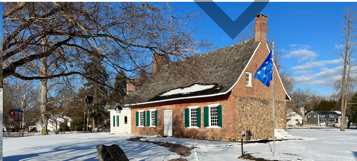
Dewint House, Tappan, built 1700

The Dewint House is located on Livingston Street within the Tappan Historic Area. The Dewint house was built in 1700 by Daniel de Clark. It was known as the De Windt House when Washington occupied it during the Revolutionary War. The one-and-a-half-story building is built of brick and local stone.