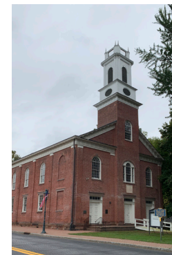
Tappan Reformed Church

The Tappan Reformed Church is located within the National Register Tappan Historic District and the local Tappan Historic Area, at 35 Kings Highway. Constructed in 1835, the brick church is significant for its Greek Revival-style architecture.