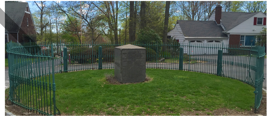
Major John André Monument

The Major Andre Monument (S/NR-Listed) is located on Andre Hill within the National Register Tappan Historic District and the local Tappan Historic Area. The black Maine granite monument is 3'6" square by 5'8" tall. Taseman and Company in Nyack created the monument in 1879, in honor of Major John Andre. Accused as a spy by the Continental Army, the British Major was hanged close to the site in 1780. The original base was dynamited by vandals in 1882.