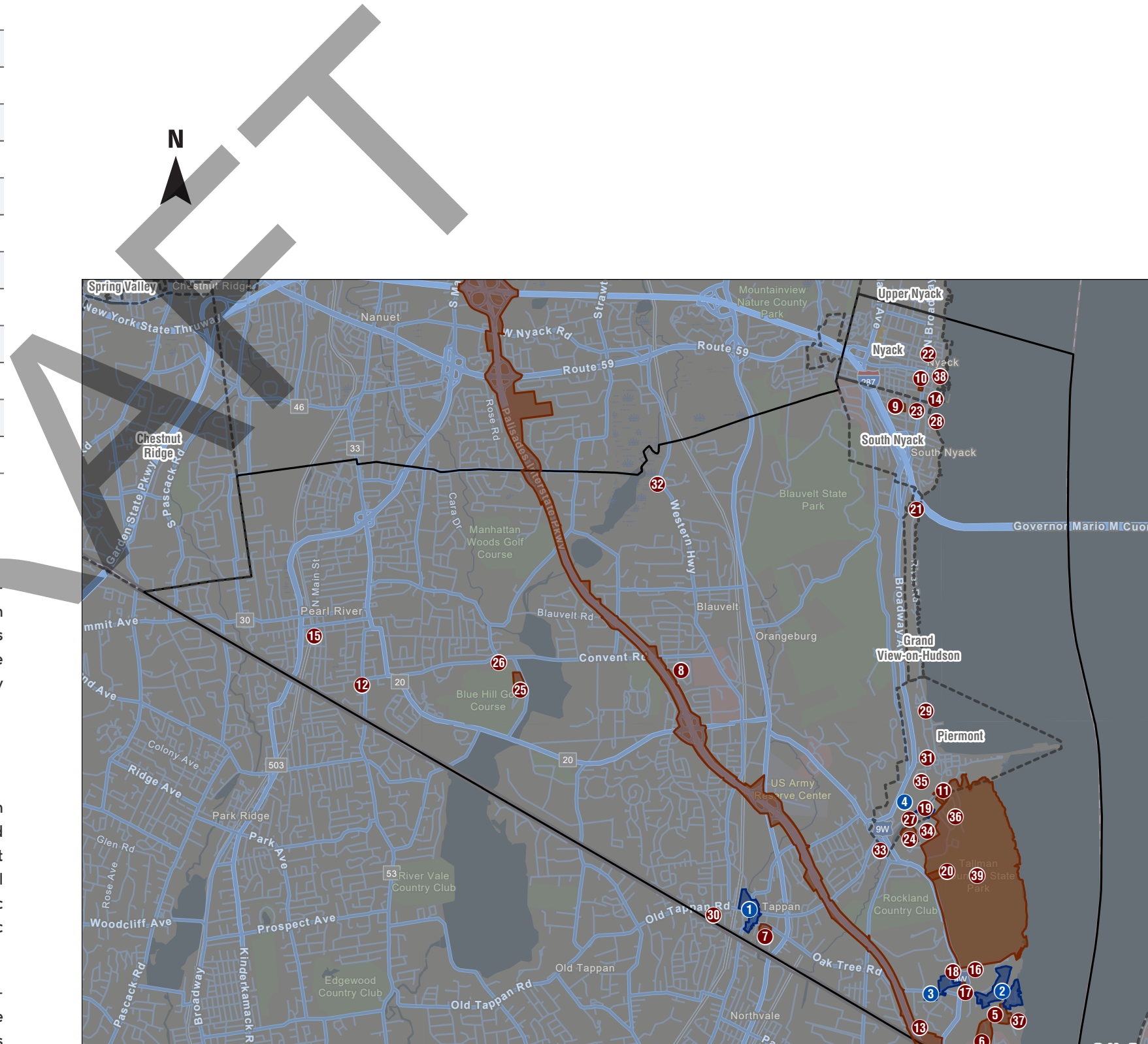
Figure 3-1 Historic Sites Map