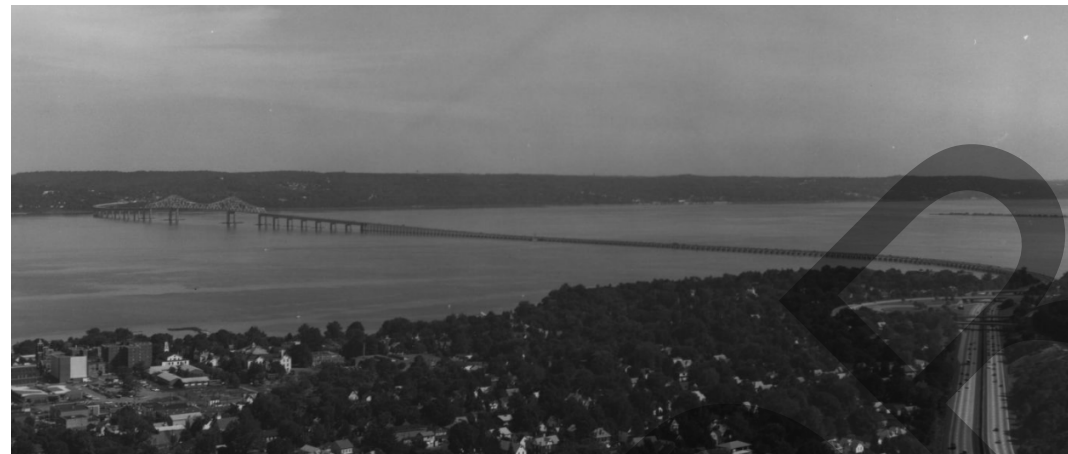
Tappan Zee Bridge, looking west, 1980.

The former village of South Nyack is a residential area on the Hudson River front, near the incorporated community of Nyack. The South Nyack community dates back to the 18th century, with settlers benefiting from the rich farmland on the riverfront. Much of the hamlet's historic fabric was lost during the 1950s with construction of the Tappan Zee Bridge and the New York Thruway. Today the former village retains older residential neighborhoods near the riverfront.