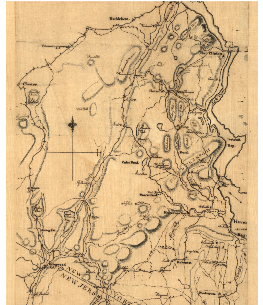
Map of Orange and Rockland Counties area of New York, circa 1750.

Early industry in Orangetown included red sandstone quarries and brick yards along the Hudson River. From 1840 to 1900, manufacturers built large brick factories. Nyack was home to multiple shoe manufacturers, as well as the steam tub and pail factory. Orangeburg became known for Orangeburg pipe, a fiber pipe used for water supply. Farming persisted as a dominant pursuit in Orangetown, including fruit and dairy farms that sent their goods to New York.