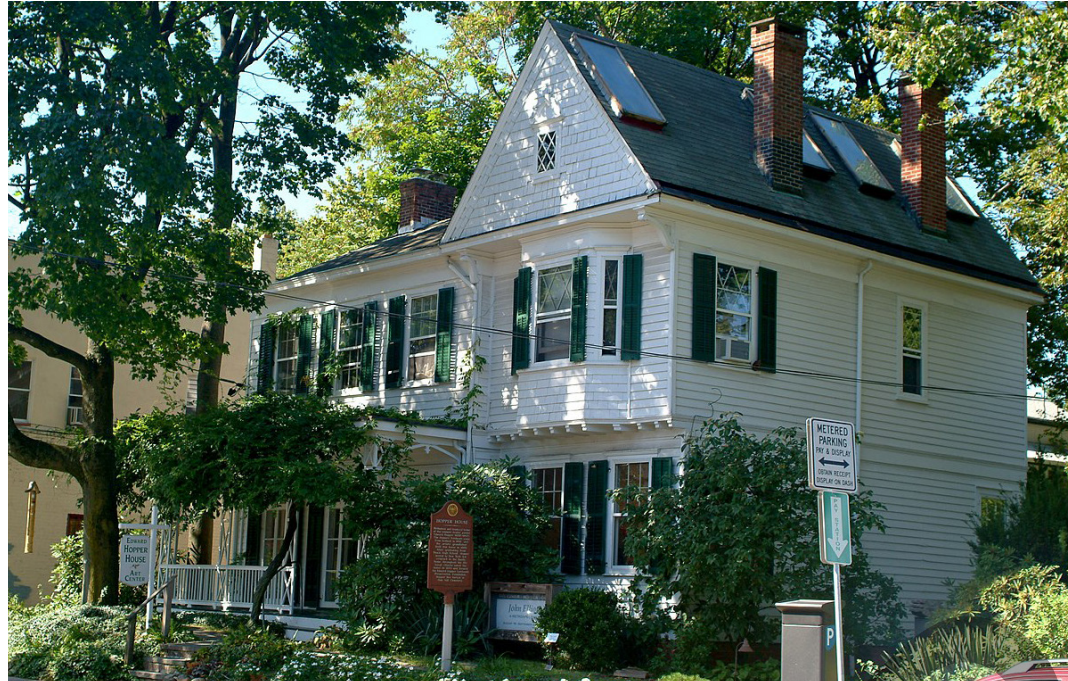
Edward Hopper House, Nyack

The mid-19th century wood frame at 82 North Broadway in Nyack (S/NR-Listed) is the birthplace and boyhood home of artist Edward Hopper (1882-1967). The two-story building is clad in clapboard siding. It features a medley of architectural styles, including features associated with the Colonial Revival, Victorian, Greek Revival and Carpenter Gothic styles.