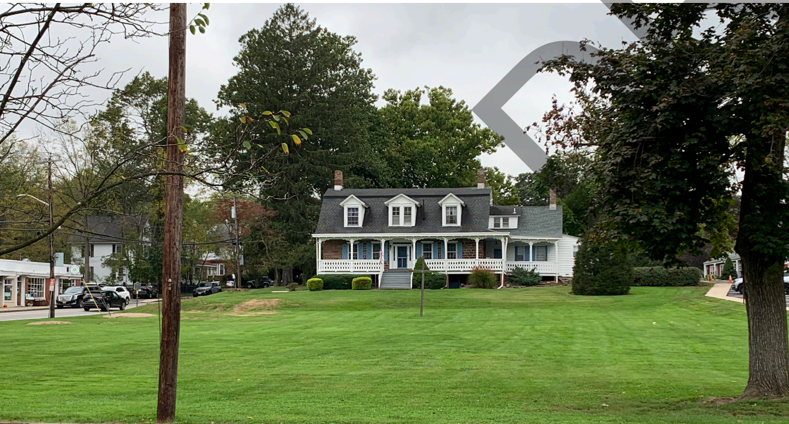
The Manse, home to Domine Samuel Verbruyck, Tappan, built 1726

Orangetown protects historic roads that are significant to the history of the Town, county, state and nation. The Town protects historic roads in order to preserve the educational, cultural, tourism/recreational, environmental and aesthetic, economic, and general welfare benefits that historic road preservation is found to provide (see Town Code §§ 19-1 to 19-8, "Historic Road Preservation"). The Town Board designates historic roads based on their historical significance and integrity. A certificate of approval is required for work that may alter or improve the road. Such alterations include material change, changes in road design, changes in signs, and changes in zoning for the land adjacent to the road. The local law requires maintenance must be carried out so as to preserve the historic and scenic features of the road. Routine maintenance must not include the following activities: widening, changes of grade, straightening or realignment, removal of stone walls or bridges, removal of mature trees, or the paving of existing unpaved roads. The legislation also regulates the existing environment along the road including any new construction along the roadside, or alterations to topography or landscaping beside the road.