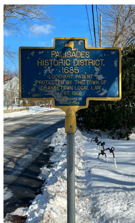
Palisades Historic District © AKRF

Within the two Historic Areas, the Historical Areas Board of Review must review all construction to buildings constructed prior to 1918. All applications for new buildings must be reviewed by the Board of Review appointed by the Town Board. Proposed changes, additions