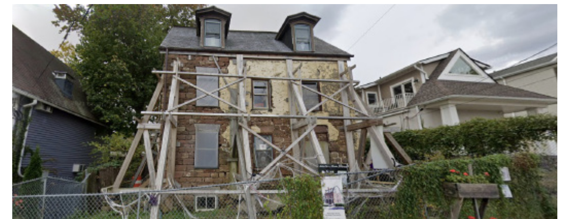
John Green House, Nyack