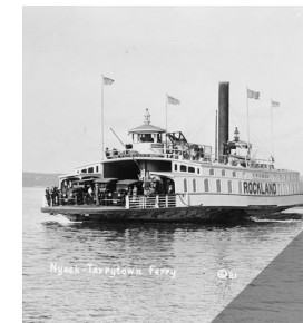
Nyack-Tarrytown ferry, New Jersey New York Hudson River, ca. 1921.

Located in the southern Hudson Valley, Orangetown was once part of the region occupied by the Lenape Native Americans. Dutch farmers moved to the area in the 17th century, attracted by the dense forest and fertile farmland located close to the Hudson River. When the British ousted the Dutch from rule in Manhattan in 1664, many Dutch farmers moved to the Hudson Valley to continue practicing their way of life. Dutch families continued to farm the land in Orangetown for over a century and the Dutch language and customs persisted here well into the 19th century. This heritage is apparent in the names for localities throughout Orangetown, such as Blauvelt (Blue fields), Sparkill (Spar creek) and Tappan Zee (Tappan Sea). Enslavement was a common practice for farmers in Orangetown, and enslaved persons of African descent were transported to Orangetown until 1827, when the New York State Constitutional Convention proclaimed emancipation for African Americans residing in the state.