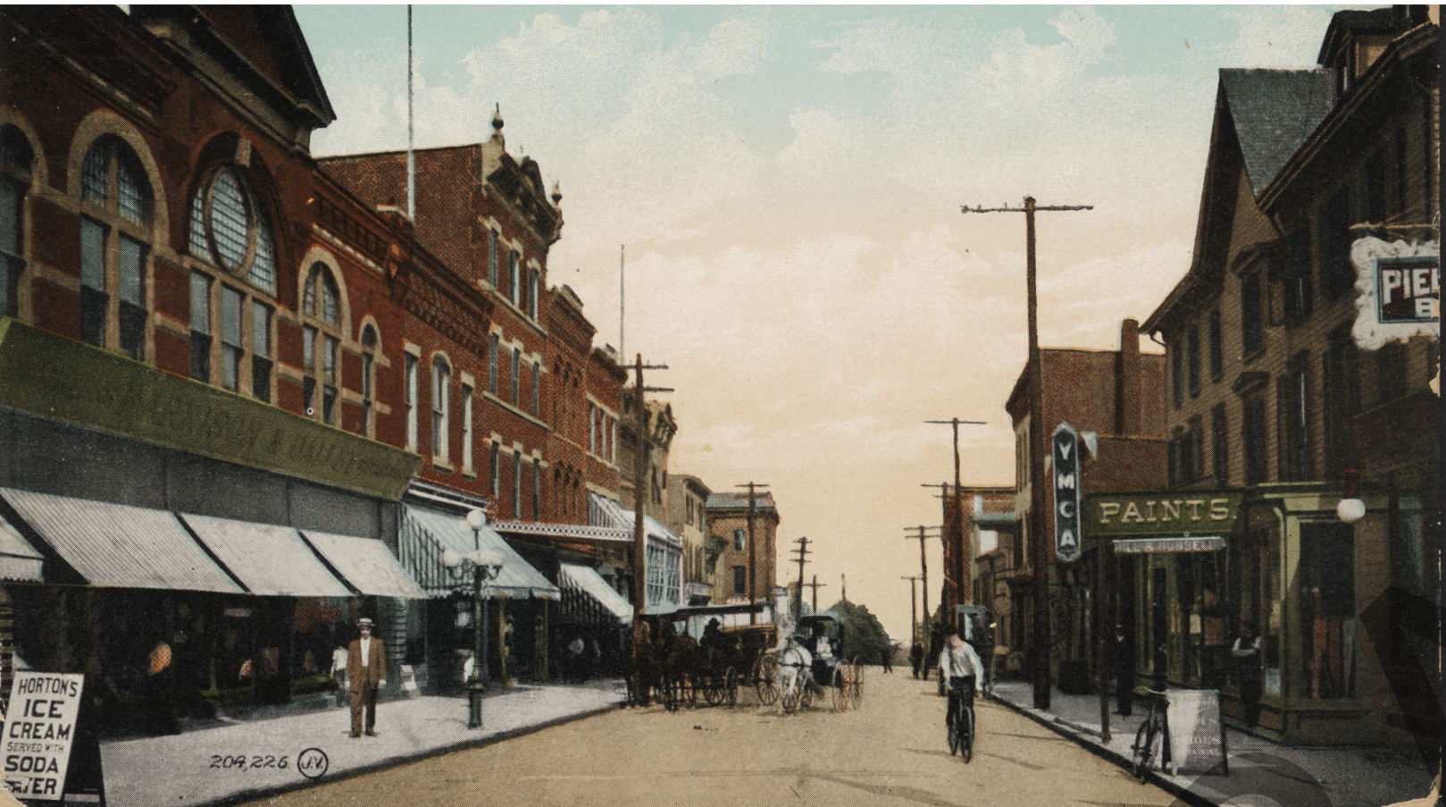
Main Street, Nyack, circa 1910.