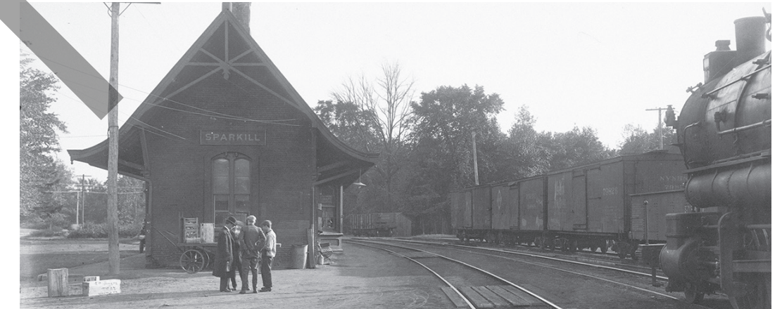
Erie Railway, Sparkill Station, circa 1880.

The small hamlet of Upper Grand View is located in the northern portion of Orangetown, up the hill from the incorporated Village of Grand View-On-Hudson. This area contained stone quarries in the early 19th century. With the extension of the railroad, the area grew with new residences, hotels and inns. The hamlet and village are named for the "grand views" overlooking the Hudson River. The hamlet is characterized by houses built into the steep hillside.