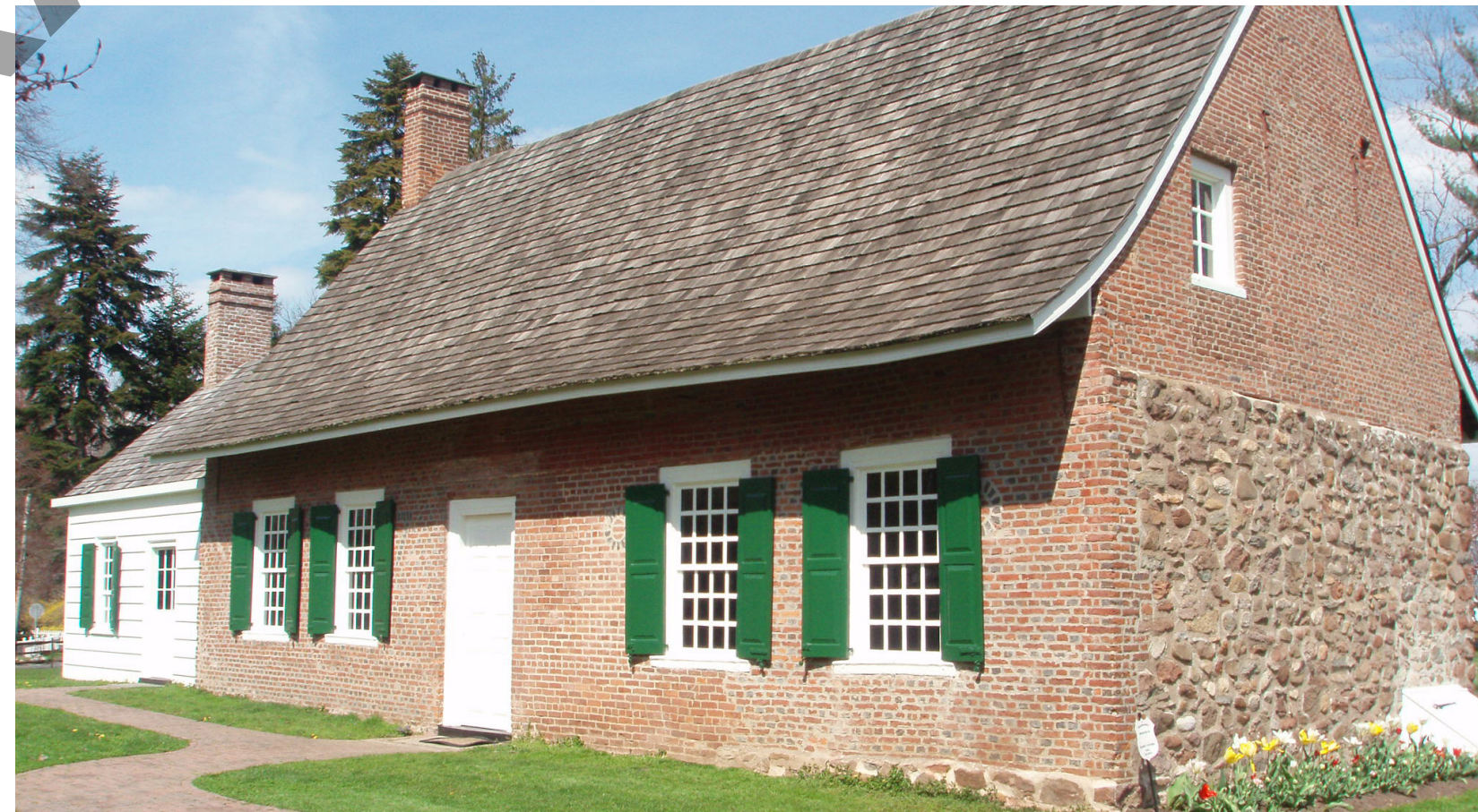
Dewint House, Tappan, built 1700.

Pursue enrollment in the Certified Local Government (CLG) Program administered by the State. CLGs are eligible to receive services from the State Historic Preservation Office, including technical preservation assistance, training opportunities, and exclusive grants.