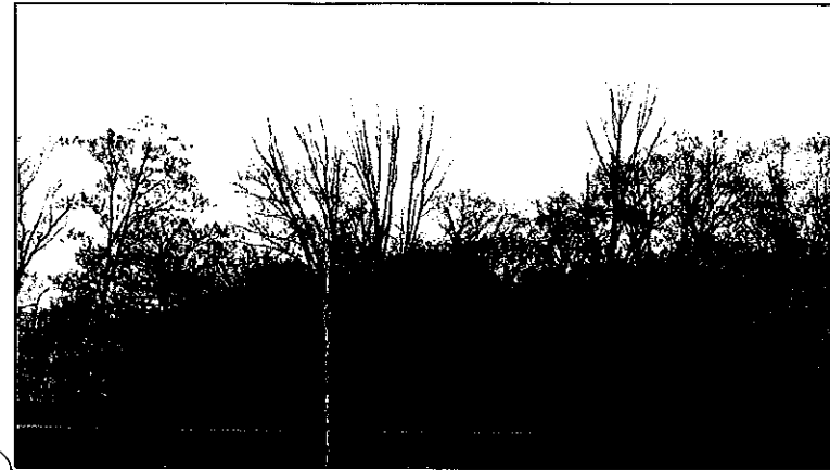
③ LOOKING NORTH WOODS