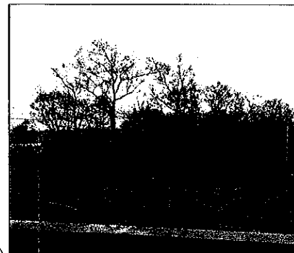
⑦ LOOKING SOUTH CAMPUS WOODS