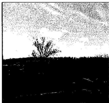
⑤ LOOKING SOUTHWEST BUILDINGS 161, 97A, 165