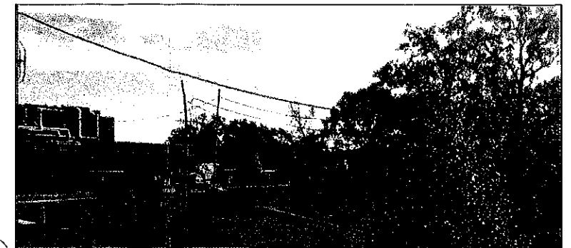
⑧ LOOKING SOUTHEAST 155 GROUP, 100 COMPLEX

ARCHITECTURE AND COMMUNITY APPEARANCE BOARD OF REVIEW