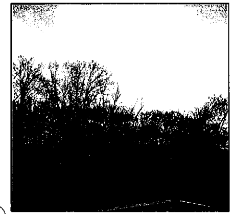
② LOOKING NORTHEAST WOODS